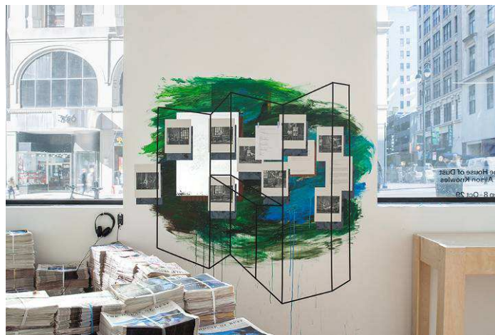
A HOUSE OF HAIR / IN A HOT CLIMATE / EXISTING IN DARKNESS / INHABITED BY PEOPLE WHO SLEEP ALMOST ALL THE TIME (quatrain from "The House of Dust" by Alison Knowles) Exhibition view, "The House of Dust by Alison Knowles", James Gallery, New York, 2016