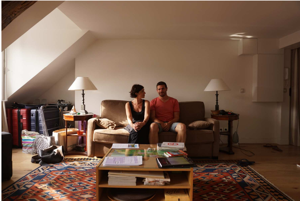
The Interloper, 2017