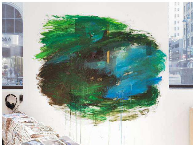
October 12, 2016 Exhibition view, "The House of Dust by Alison Knowles", James Gallery, New York, 2016